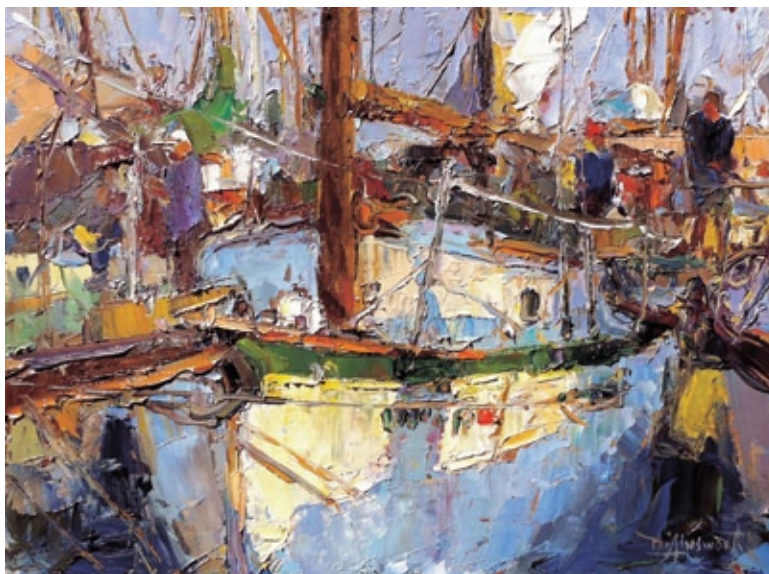
DIANE AINSWORTH, DOCKSIDE, OIL ON PANEL, 9 X 12"

Peter Batchelder will join the show with Blue Barn , based on his affinity for barns and architecture in general. "But my pursuit in painting barns is less to simply do paintings of barns, but to use the shapes of barns and to push the palette to an almost abstraction, where color, texture, and brushwork are more the focus of the painting than the structure," says Batchelder. " Blue Barn is about color and shape and texture and is one I feel works as well in its small scale, as it would as a larger piece." •