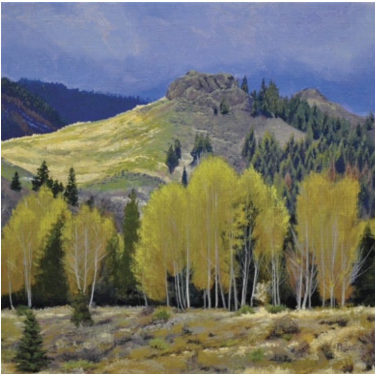
NEAL PHILPOTT, OUT CROP, OIL ON PANEL, 10 X 10"