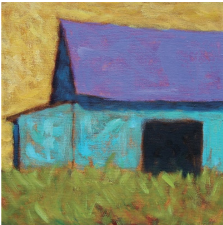
PETER BATCHELDER, BLUE BARN, OIL ON CANVAS, 12 X 12"

For a direct link to the exhibiting gallery go to